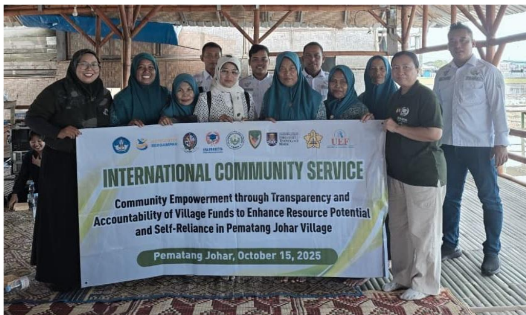
Figure 4. Group photo with the community of Pematang Johar Village