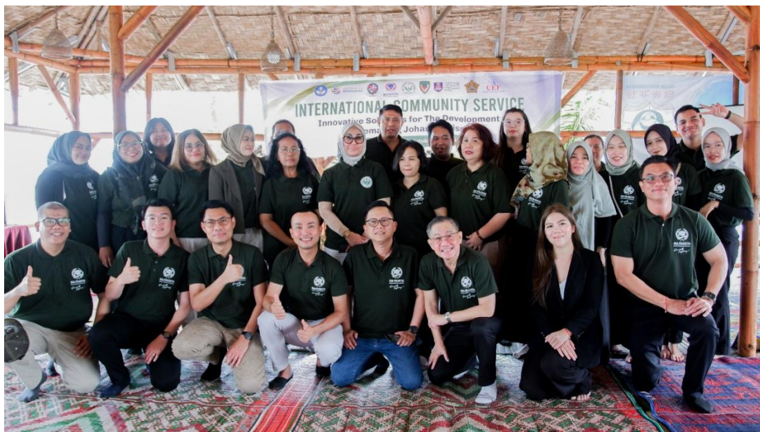
Figure 1. International Community Service in Pematang Johar Village

The International Community Service activity was held on Wednesday, October 15, 2025. The event was organized by Eka Prasetya College of Science with the theme Innovative Solutions for the Development of Pematang Johar Tourism in Pematang Johar Village . This event was held in collaboration with several countries, through cross-border cooperation, individuals and organizations can share knowledge, technology, and experience to improve the quality of research. The event was attended by representatives from Universiti Teknologi Mara (UiTM) Malaysia, Shinawatra University Thailand, University of Economic and Finance Ho Chi Minh (UEF) Vietnam, Universitas Negeri Medan, Universita Quality Berastagi, Universitas Siah Kuala, representative of UOW Malaysia KDU UC Penang, Universitas Royal dan STIE Dharma Putra Pekanbaru, in addition, this activity was also attended by the community and officials of Pematang Johar village.