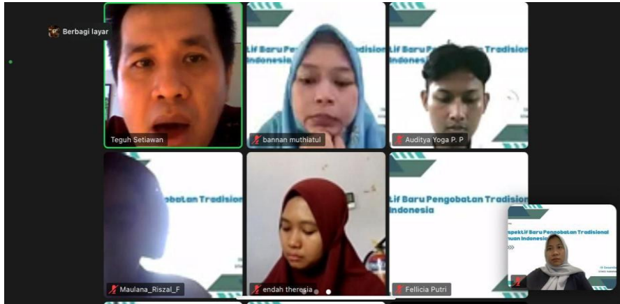
Figure 3. Discussion of Speaker and Participants in the Socialization