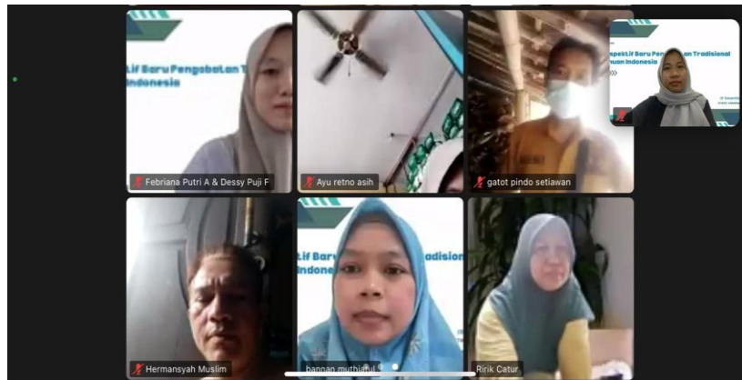
Figure 1. Ketua STIKes Harapan Bangsa Jember Gives a Welcome Speech and Opens the Event

Research This can lead to discovery method new in treatment, development product new, and validation scientific from efficacy drug made from nature. This is very important for increase credibility and acceptance use material natural in public.