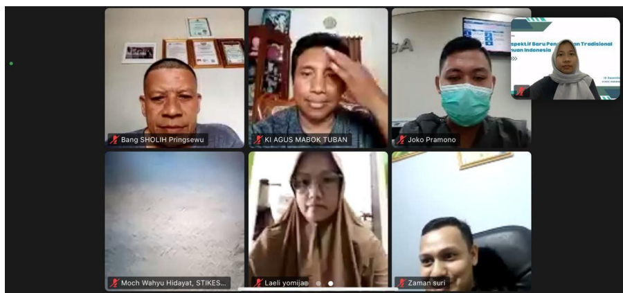
Figure 4. Group Photo of All Participants with the Committee and Speakers